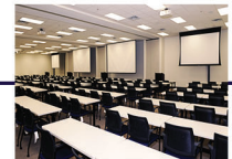
Pictured: The Pit (Left) Large Conference Room (Right)

Large Conference Room: Our opened Large Conference Room includes a total of 4 screens: (2) 189" retractable projection screens (center), and (2) 125" retractable projection screens (ends), 4 HD projectors, 4 standard hand-held microphones, "Crestron" software audio/visual setup (HDMI/VGA connection), built-in surround sound, 4 podiums, 8 seating columns with 7 rows each (connected tables), approximately 4 chairs per row, seating capacity of 224.